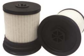
PGF408 2014 Jeep Grand Cherokee 3.0L Diesel Fuel Filter Now Available

PTC offers an extensive line of Fuel Filters for most domestic and import applications, including Ford Powerstroke, Diesel Fuel Filters for GM Duramax and Dodge Cummins engines. Universal fuel filters are also available in a variety of inlet / outlet line dimensions.